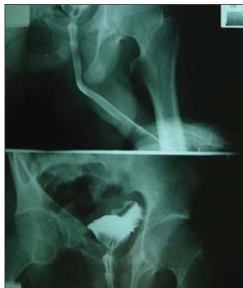
Fig.-6: (Case - 2 : Post urethroplasty anastomotic leakage in 21st. POD.) Repeat retrograde peri-catheter urethrogram ( 3 week later) : Dye has passed into the bladder and there is no leakage in the anastomotic site.

High risk group :- straddle and Malgaigne fractures. These types of fracture results sudden upward displacement of hemi-pelvis specially