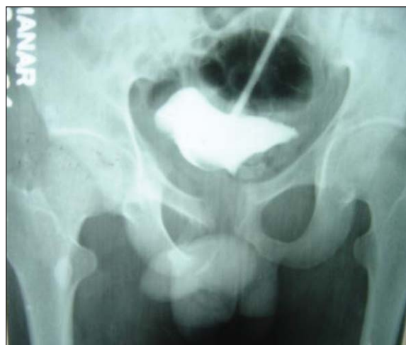
Fig.-2: (same patient): Antegrade Cystourethrogram : Bladder is outlined, dye has not passed into the prostatic urethra due to bladder neck spasm.