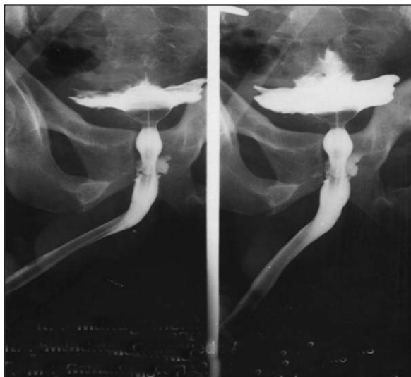
Fig.-5: (Case - 2) : Post bulbo-prostatic perineal anastomotic urethroplasty. Retrograde peri-catheter urethrogram (21st. POD) : Dye has passed into the bladder and there is leakage in the anastomotic site. Urethral catheter was decided to continue for another 3 week.