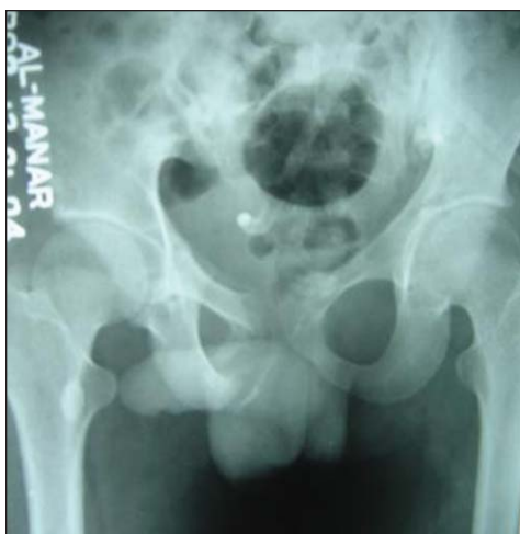
Fig.-1: Control film : RGU + Antegrade cystourethrogram. (Healed mal-united pelvic fracture, suprapubic catheter in situ)