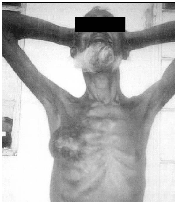
Fig-2: Stage III, Squamous cell Carcinoma, In a man of 60 Years