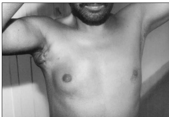
Fig-3: Stage III, Sarcomatous Lesion, in a man of 35 Years