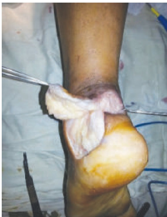
Fig-4: Flap Elevation

Surgical procedure was performed under a tourniquet and surgical loupes of 2.5 magnification. The defect was measured at its two maximal dimensions after wound excision and then the flap was marked on skin. Dissection is begun at the lateral aspect of the calcaneal region and is carried out distally to the periosteum of the calcaneus. The plain is then developed leaving the periosteum intact. The anterior incision is made immediately behind the lateral malleolus and carried down through the subcutaneous tissue. Finally the distal horizontal incision is made and the flap is raised in a retrograde fashion. Optimally the vessels are not exposed and therefore not traumatized. Dissection is carried out in a