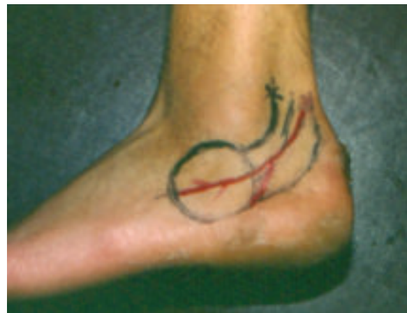
Fig-3: Preoperative design of the flap. 1