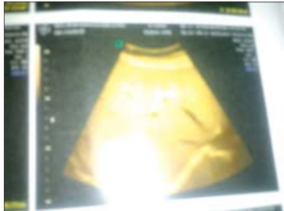
Fig.-4: Ultrasonographic Scan

The patient underwent laparotomy but during the procedure gall bladder was absent. The extra hepatic biliary apparatus were normal.