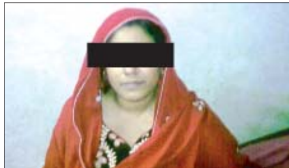
1 st Patient (Printed with Permission)