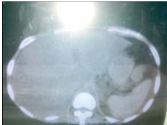
Fig.-5: CT Scan