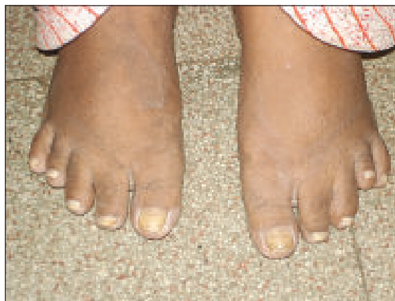
Fig.-2: Showing short left 4 th toe, onychomycosis, hyper pigmented & hyperkeratotic lesion over the dorsum of the foot.

Chvostek's and Trousseau's signs were positive. She had papilloedema in the left eye and cataract in the right eye. The hands and feet were stubby and her left 4th toe was found short (Fig- 2).