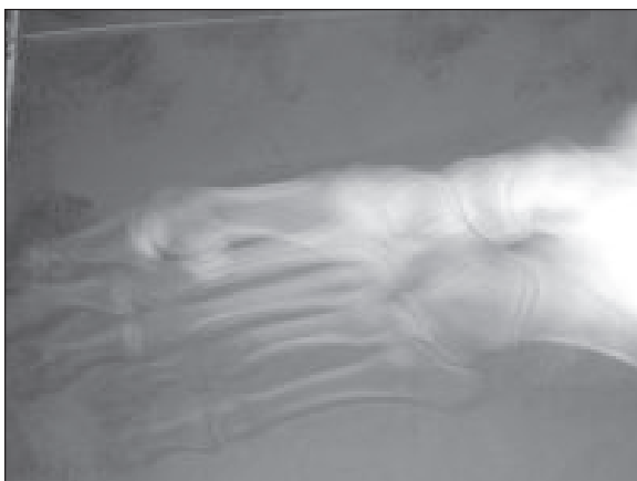
Fig.- 3: X-ray left foot showing short 4th metatarsal