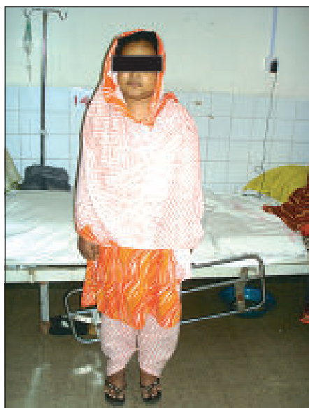
Fig.-1: the patient showing short stature, short neck & rounded face.

On examination she was of short stature, being only 4' 6" and was depressed. She had rounded face, short neck (Fig-1), onychomycosis, and oral candidiasis. There was excessive pigmentation around pressure areas.