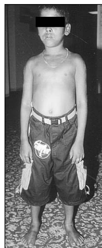
Fig-4: After remission from WCD.

The child had good therapeutic response with steroid and other supportive measures within two weeks of initiating therapy. He was on monthly follow-up. One year clinical, hematological and radiological follow-up revealed no relapse of the disease with disappearance of nodules, regression of hepatosplenomegaly, disappearance of ascitis, normal ESR (11mm), and marked improvement of reticulonodular shadows on lung fields.