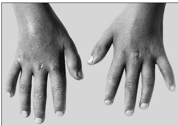
Fig-2: Erythematous nodules with atrophic central area and swollen small joints of hands.

On examination, he was found dyspnoeic, mildly pale, febrile, tachypnoeic and had tachycardia. He had multiple erythematous nodules over the back of the trunk (Fig. 1) and dorsal aspect of hands (fig-2). The nodules had atrophic central area. Locomotor system examination revealed swollen and tender knees, ankles, elbows, wrists and small joints of hands. He had apex beat in the left 5th intercostal space just lateral to mid clavicular line, palpable P2 and gallop rhythm. Lungs were full of crackles and rhonchi. He also had hepato-splenomegaly with ascities. Other systemic examinations were normal.