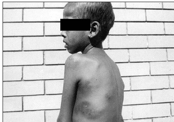
Fig-1: 9 years old boy with multiple erythematous nodules.

A 9-year-old male child, 1st issue of a day-labourer, weighing 21.5 kg, immunized as per EPI schedule admitted into ICMH, Dhaka with the complaints of fever for two years, pain and swelling of multiple small and large joints for one and a half year, non-productive cough and difficult breathing for 10 days before admission. The joint pain was not migratory and there was no history of morning stiffness. He had been suffering from repeated attacks of common cold since 2 years of age. He denied any history of trauma or abdominal pain. There was no history of contact with a tubercular patient.