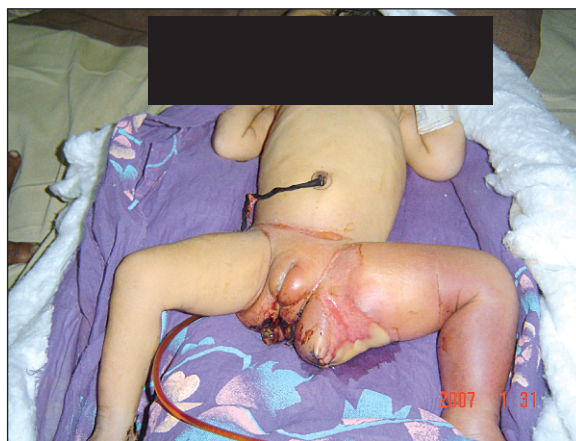
Fig-2: Appearance of the baby after operation.

The postoperative recovery of both the mother and the baby was uneventful. However edema with restricted movement of the left leg of the baby persisted during her hospital stay (Fig-2). They were discharged from the hospital on 10 th postoperative day.