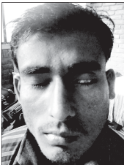
Fig.-2: Incomplete Closure of The Left Eye on 7th POD

pharynx. The cyst wall carefully separated from the surrounding tissue and removed along with deep lobe of the parotid gland. The zygomatic branch of the facial nerve which was adherent with the cyst was sacrificed. Haemostasis ensured and the wound closed in single layer leaving a drain in situ. The drain tube collection was 50 cc blood. The drain removed on third post-operative day. The parotid tissue and cyst were sent separately for histopathology. Histopathology of parotid tissue revealed no pathology but histopathology of cyst wall revealed Neurilemmoma. Patient was discharged from the hospital on 8 th POD with facial palsy involving the area supplied by zygomatic branch resulting in inability to close the left eye completely.