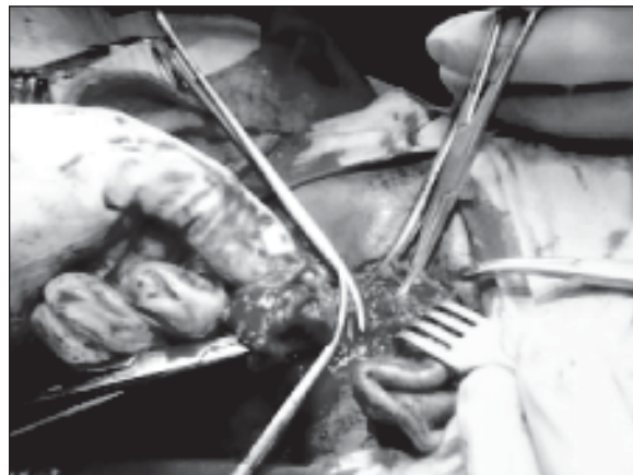
Fig-1: Excision of the cyst

swelling, which had appeared 5 months earlier and which had been growing slowly and steadily. He had no other symptoms, his otolaryngologic and general physical examinations were completely normal. The lump was globular in shape; margin was rounded, firm in consistency, free from overlying skin and underlying muscle. It was mildly tender. It was over the posterior margin of the mandibular ramus. The facial nerve function was normal on clinical evaluation. Ultrasonography of the gland revealed parotid cyst. FNAC of the parotid gland revealed neurilemmoma. The patient underwent a left total parotidectomy with a complete excision of the cyst. During the surgical procedure parotid gland was exposed. The superficial lobe was intact and the swelling was palpable within and deep to the deep lobe.