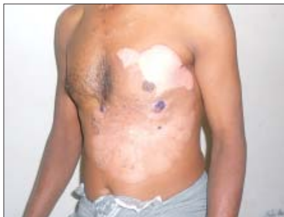
Fig.-1: Photograph of the patient with a large well defined plaque, surrounded by a keratotic wall in the chest and multiple nodules within the large plaque.

creatinine) parameter was within normal limit. From two sites of skin, biopsy material was taken, one from margin of the plaque and another from large nodule and sent for histopathological examination. A section of skin from margin of the plaque reveals mild hyperkeratosis and a shallow depression containing columns of parakeratotic cells. Epidermis below this area shows dyskeratotic changes and the dermis reveals a moderate infiltration of chronic inflammatory cells. These features are confirmatory of porokeratosis, on histo-pathologically, though classical or plaque type porokeratosis variety on clinically. Section from nodules reveals an invasive squamous cell carcinoma. The tumor is well differentiated. It has invaded the subcutis. The deep margin shows presence of tumor (Grade-I). Patient was treated by topical steroid and retinoid and advised for excision of nodule.