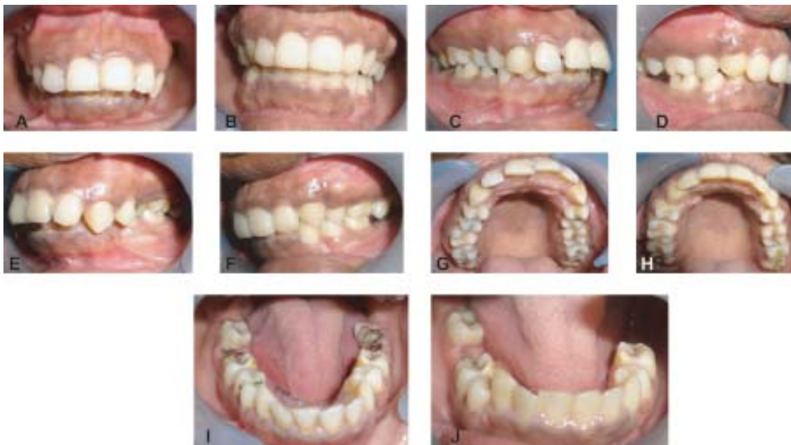
Fig-2: Patients intra oral photograph shows pre treatment front view (A), right lateral view(C), left lateral view(E), upper occlusal view(G),lower occlusal view (I) and post treatment front view (B), right lateral view(D), left lateral view(F), upper occlusal view(H),lower occlusal view (J).

exposure of upper teeth and gingiva noticed in resting condition. Smile analysis shows excessive exposure of upper and lower gingiva and teeth, beyond the lower border of upper lip and upper border of the lower lip causing the distortion of smile arc which ultimately resulting ill facial appearance during smiling and laughing (Figure 1 A,B). Intra-oral examinations reveal carious both upper second molar teeth, badly broken lower left second molar(37), third molar(38) and right second molar(47) teeth (Figure 2 A,C,F,G,I) with