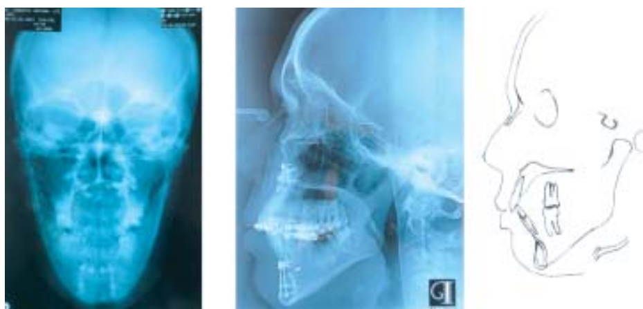
Fig.-6: Cephalometric evaluation of post treatment occlusion and skeletal relationship by frontal cephalometric radiograph (A), lateral cephalometric radiograph (B), and tracing of lateral cephalometric post treatment radiograph (C).

After removal of the dental braces patient's was also advised for prosthesis teeth replacement on lower posterior edentulous space. Threading of her facial hair over her upper lip and removal of mole on her left cheek with leaser therapy was also advised to improve external facial appearances. Repeated phone contact was made with patient and her parents, to ensure them the prosthetic teeth replacement and beautification of her facial skin to improve outlook, however she and her parents were too satisfied with their existing treatment outcome to make any further delay for her marriage settlement. So, no further collection of photographic records with occlusion having proper teeth prosthesis and a photogenic face with exotic look women appearances were not possible to present. Though patient reported to be healthy and having a happily married life till date.