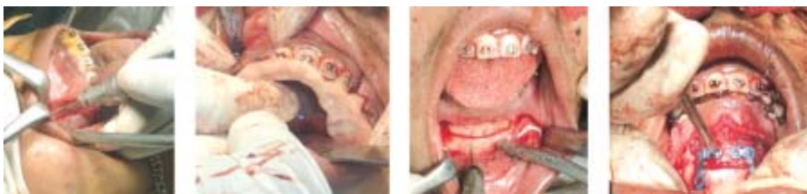
Fig.-4: Intra oral photograph shows steps of orthognathic surgical technique vertical cut on right maxillary vestibule (A), occlusal relation checking with acrylic wafer after finishing of segmental osteotomy on maxilla(B), subapical anterior mandibular cut on mandible (C), and fixation of mobile segment with miniplate screw (D).

Post surgical intermaxillary fixation to maintain the vertical position of the teeth and increase intercuspal interdigitation elastic with bracket hook and arch wire were used. After 6 weeks of post surgery arch wire were changed and final finishing tooth movement were done with a 0.018×0.22 NiTi wire and 0.021×0.22 NiTi wire successively. Patient was advised to use light elastic full time, including while eating for the first 4 weeks after surgery; full time except for eating for another 4 weeks; and just at night for a three week period. After 3 months of post surgical treatment patient braces were removed and removable hawleys retainer on both jaws was given to use. An improved occlusion relation (Figure 1D,C and 2 B,D,F,H,J) was achieved with a favorable skeletal change as mentioned in Table 1.