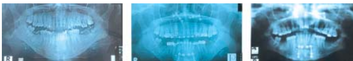
Fig.-5: Photograph of oral panoramic radiograph(OPG) shows pre treatment occlusion (A), post surgical occlusion (B) when there is braces to continue post orthodontic treatment, and final finishing occlusion (C) after removal of orthodontic braces.