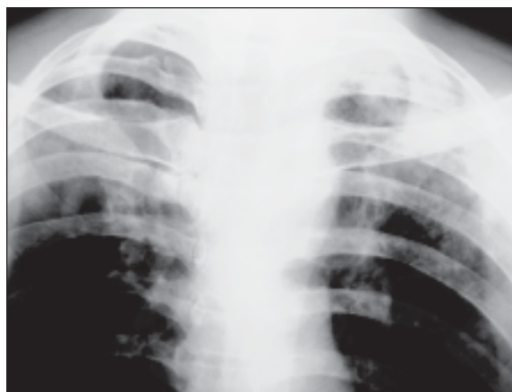
Fig.-2: Bilateral patchy opacities in both upper zones of lungs.

Mean while chest X-ray and USG, CT of abdomen were done for further delineation of pathology. CXR showed bilateral patchy opacities in upper zones of lung fields consistent with radiological tubercular changes (Figure.-2). Both USG of whole abdomen and CT of the abdomen detected bilateral enlarged adrenal glands, left one being larger (28×19 mm), with no calcification (Figure.-3). Histopathology of CT guided FNA the Left suprarenal gland revealed blood and shadowy outline of necrotic cells.