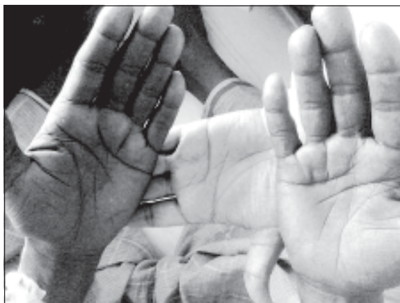
Fig.-1: Hyperpigmentation of palmer creases.

Clinical examination revealed: pale conjunctiva, low blood pressure as 90/60 mmHg with postural drop, low volume rapid pulse as 92/bpm, temperature as 99.5°F, some dehydration, BMI as 17.56kg/m 2 . hyperpigmentation of palmer creases (Figure.-1), knuckles, axilla, recent scars, buccal mucosa. With centrally placed trachea, increase in vocal fremitus, woody dull note and bronchial sound were found in left front of chest along 2 nd - 3 rd intercostal spaces along with bilateral crackles in upper and mid areas of chest. He had left convergent squint since childhood.