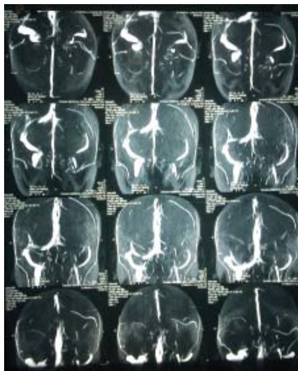
Fig.-3: MRV of brain and neck vessels- Normal