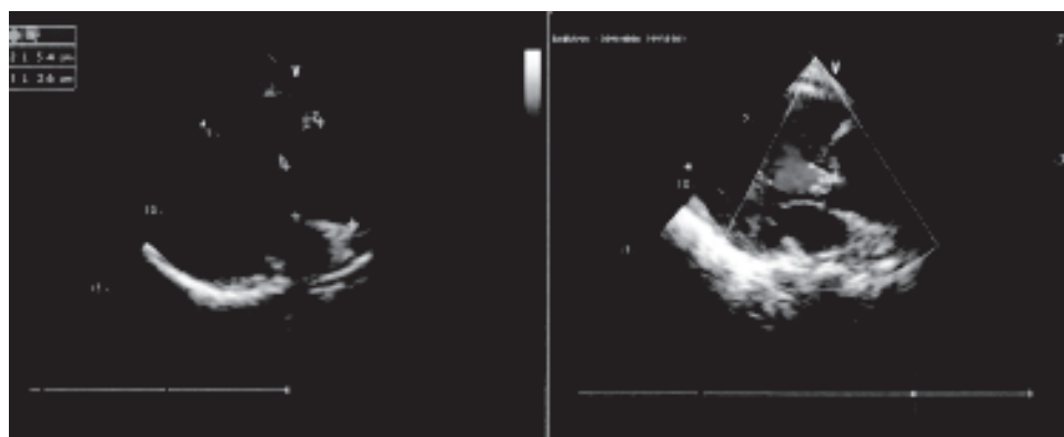
Fig.-1: (a) 2D echocardiography showing dilated aortic root. (b) Colour Doppler echo showing aortic regurgitation

She was transfused with 3 units of packed cells. For hypertension, she was started on Losartan Potassium 50mg OD, Metoprolol 25mg BD and Frusemide/ Spironolactone combination which she is currently on, with fair BP control. Having ruled out the differential diagnoses of syphilis, TB and Systemic Lupus Erythematosus (SLE) by negative blood work, we proceeded to a working diagnosis of Rheumatic Fever, given her raised ASO titres, and commenced her on high dose aspirin and oral prednisolone starting from 60mg OD in a tapering dose along with penicillin. However, she showed no clinical improvement; ASO titre, ESR & CRP remained persistently high. As she did not fulfil the modified Duckett Jones criteria for rheumatic fever, and also as there were no valvular lesions suggestive of rheumatic carditis on echo, the differential diagnosis of Rheumatic Fever was abandoned. Aspirin and penicillin were omitted. In addition, a relook echo