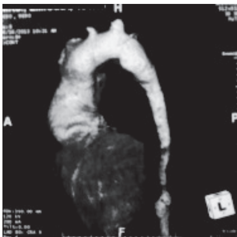
Fig.-3: CT angiogram showing dilated aortic root and stenosis of descending thoracic aorta

We then proceeded to further imaging: a multiple axial CT angiogram of the aorta revealed dilated root of aorta (49.2mm) and proximal portion of the ascending aorta (32.2mm). Arch of aorta appeared normal. A narrowing was noted in the descending thoracic aorta (7.71mm) with post-stenotic dilatation (14.7mm) (Figure 3). A 3D MR angiography concurred with these findings: moderately dilated ascending aorta more marked in the root (49.44mm), with normal aortic arch and its branches revealing no abnormality (Figure 4).