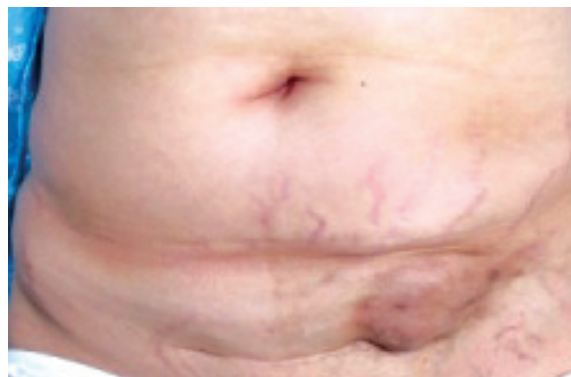
Fig.-1: Pre operative image of scar endometriosis