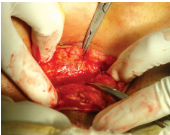
Fig.-2: Per operative image of scar endometriosis