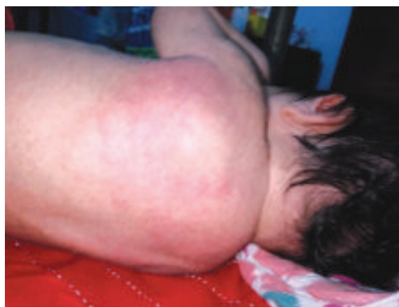
Fig.-1: Erythematous plaques on back of the patient