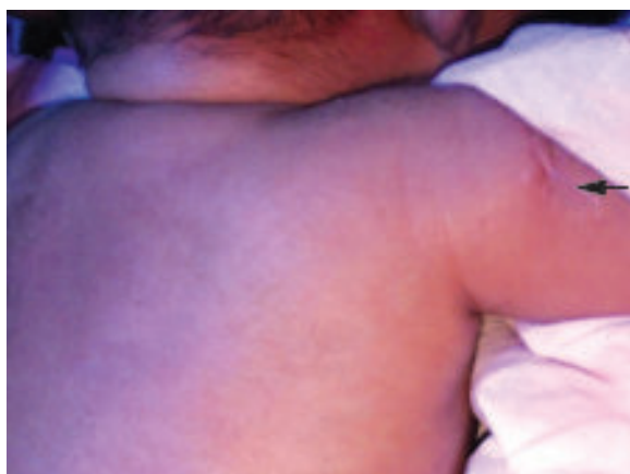
Fig.-2: Biopsy area (arrow) while lesions are almost healed

The baby was referred to skin specialist as the lesion gradually extended up to bilateral thigh and buttock. According to his advice serum C3, C4, p-ANCA, c-ANCA were done which revealed normal. A diagnosis of Subcutaneous Fat Necrosis (SCFN) was made after taking biopsy from the lesion (Fig.-2). The patient was