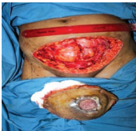
Fig.-4: Surgical treatment