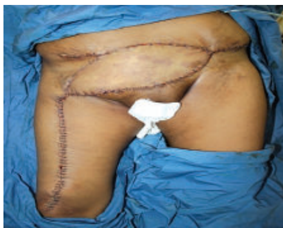
Fig.-5: After rectas femoris flap coverage