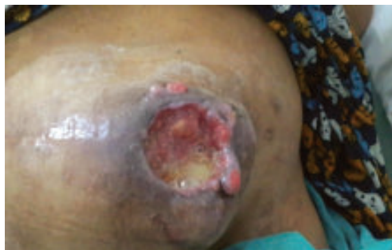
Fig-1: Swelling over lower abdomen