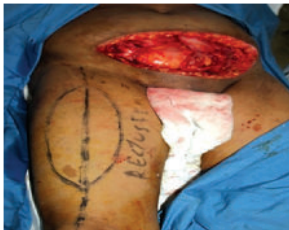
Fig.-3: Surgical treatment

Trans-vaginal USG revealed that uterus was absent. There was a small irregular hypo echoic soft tissue structure (3.4x2.3) cm posterior to urinary bladder which could not be separated from the vault. MRI finding showed recurrence of carcinoma in vault (6.5x3.2) cm. There was a metastasis (13.5x8x8.5) cm in lower anterior abdominal wall occupying more on left para-median wall. Anteriorly it invaded the muscles, subcutaneous fat and skin of anterior abdominal wall and anterior wall of urinary bladder posteriorly. There was no bony involvement and no pelvic lymphadenopathy or ascites.