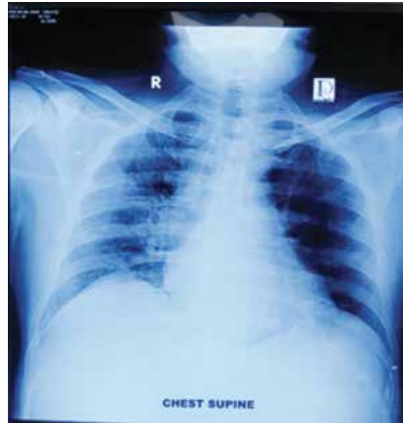
Fig:1 – CXR on Day 17 showing bilateral lung peripheral opacities

Patient came for follow-up 10 days later (Day 42 from symptom onset) with a repeat HRCT chest which showed huge improvement (Fig:4). CBC and other markers including CRP, ferritin, lactate and LDH were also reduced within normal limits.