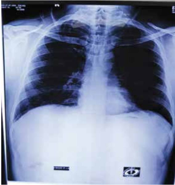
Fig:3 –CXR on Day 31 showing marked improvement