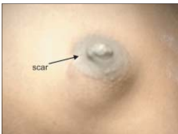
Fig. 1. Photograph of left male breast with epidermal inclusion cyst

2% monocytes. Haemoglobin (Hb) was 108gm/L, ESR 05 mm, RBS: 5.5 mmol/L and S. Creatinine 72.6 \mu mol/L. Plain radiograph of chest and USG scanning of abdominal organs were normal. The patient had been subjected to elective surgical intervention. on 14.05.2009. The lump was removed by submammary periareolar incision under GA. The lump was cystic in nature with cheesy material inside (?Granuloma), per operative diagnosis being tuberculosis of breast. Per operative diagnosis was definitely influenced by the cytological findings on FNAC. Histopathological examination of submitted specimen showed breast tissue associated with a cyst wall lined by stratified squamous epithelium filled with keratin materials (Fig.2). Histological diagnosis was Epidermal inclusion cyst of the breast.