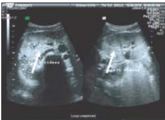
Fig.-4: Ultra sonogram abdomen showing hyperechoic renal parenchyma with loss of cortico-medullary demarcations in both kidneys.

Patient refused to undergo planned renal and nasal biopsy. She was diagnosed as diffuse Wegener's Granulomatosis on the basis of clinical, serological and radiological findings.