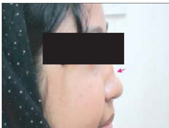
Fig-2: Photograph showing depressed nasal bridge as showed in arrow head area

On examination, she was ill looking and markedly pallor with depressed nasal bridge as shown in figure 2, thin emaciated with 40 Kg weight.