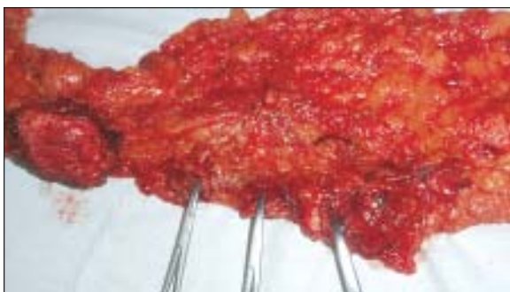
Fig.-2: Post operative view of greater omentum shows three metastatic seedlings marked by artery forceps

Recurrence develops within 3 years after radical surgery for co-lon cancer in 83.6% of recurrent colon cancer cases and is very rarely detected after 5 years (3.6% of cases) 1 . Therefore, regular follow-up with various diagnostic modalities until 5 years after surgery is a reasonable strategy to detect recurrent disease. The commonly used imaging modalities in such cases include ultrasonography, computed tomography (CT), and magnetic resonance imaging (MRI). However, 18 F-fluorodeoxyglucose glucose-positron emission tomography (FDG-PET) is more effective in determining the presence of malignancy, especially in cases of colorectal cancer (CRC) 2 .