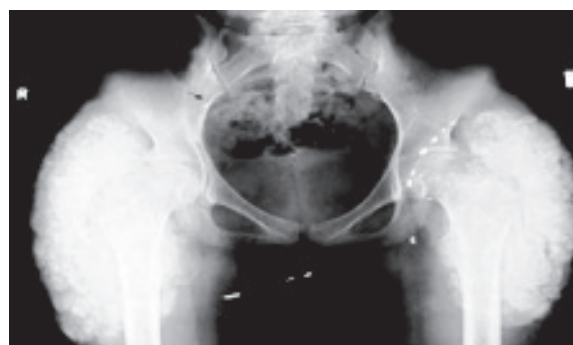
Fig.-3: Xray pelvis AP view

periarticular distribution. The patient was diagnosed as a case of Familial Hyperphosphatemic Tumoral Calcinosis.