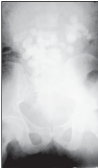
A. Plain X ray KUB shows palisades of radioopaque shadows of different sizes suggestive of stones maintaining the shape of horse shoe kidney.

can be seen on plain radiographs, but the definition is not as clear as in some of the other modalities. They will be discovered on plain radiographs because of their lower location and the location of the lower poles being more medially rotated than would be expected, ureters as well, to see if there are any abnormalities lower in the system.