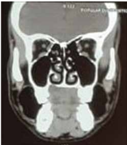
Image 2: Computed Tomography axial view shows focal bony erosion with overlying soft tissue thickening on right hard palate and adjacent alveolar process.