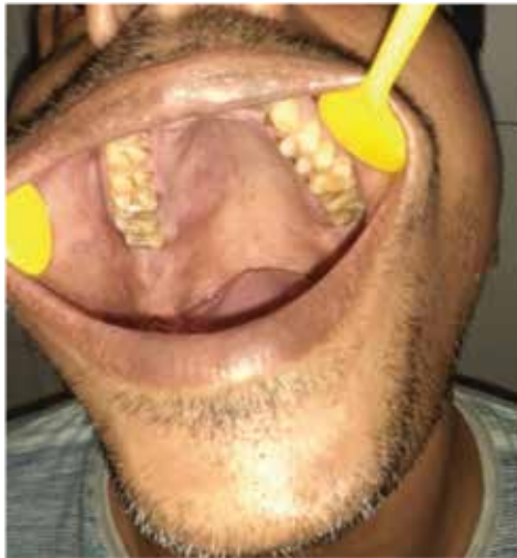
Image 1: Well-defined, oval shaped, smooth surfaced swelling without any surface ulceration at right side of the palate near molar teeth.

Though the lesion was small, due to intra cranial extension, tumor board decided and treated patient by chemoradiation. Patient is under follow up of both maxillofacial and oncology departments. This report emphasizes the importance of meticulous clinical and MRI evaluation of any suspected malignant palatal mass before deciding surgical treatment.