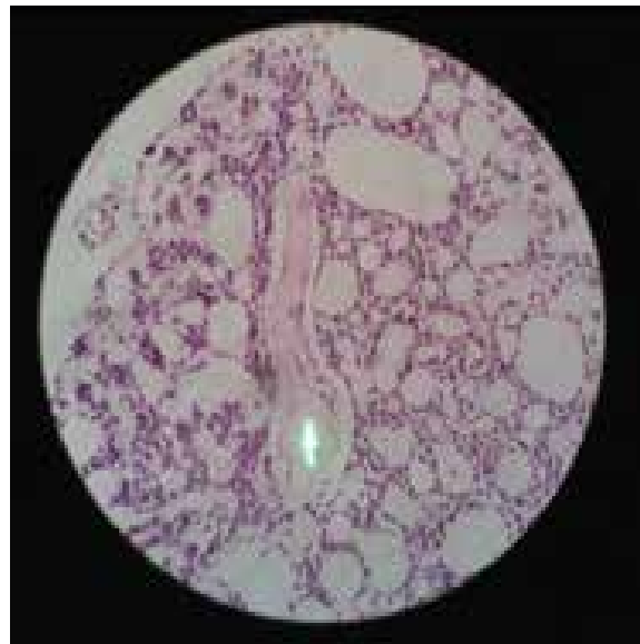
Image 3: Microscopic picture showing perineural invasion in adenoid cystic carcinoma. Arrow is indicating nerve fibers. (40X10)